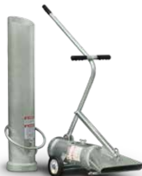
Floor Sweep Nozzle