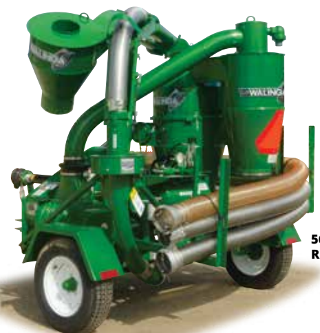
5614 DLX REAR VIEW